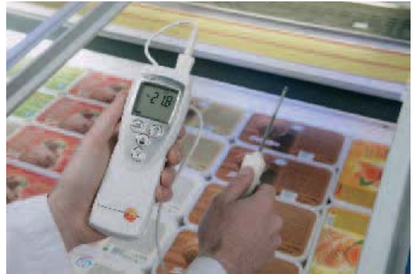
Air temperature measurement in refrigerated display counters and freezers