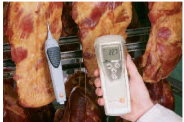
Measurement of penetration temperature when smoking foods, wireless radio transmission of measurement data

testo 926-1, 1 channel food temperature measuring instrument T/C Type T, audible alarm, connection to an optional radio probe, with battery and calibration protocol