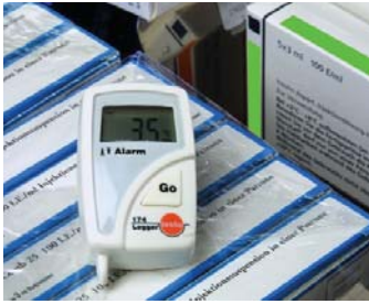
... in refrigerated areas