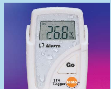
Watertight, IP 65