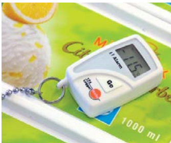
... in refrigerated cabinets/displays