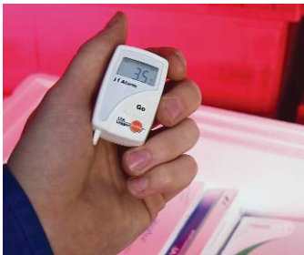
... during transport and in containers