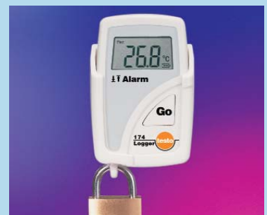
With wall holder and lock